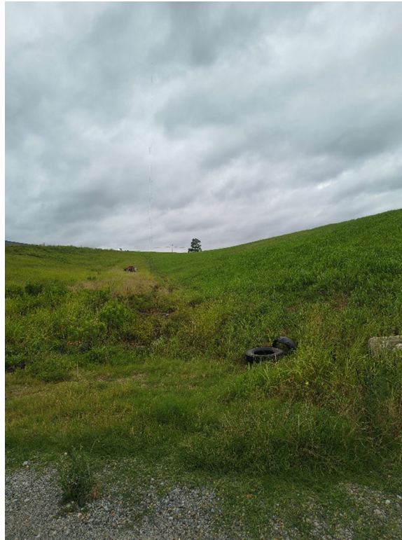
Looking west along south side of landfill