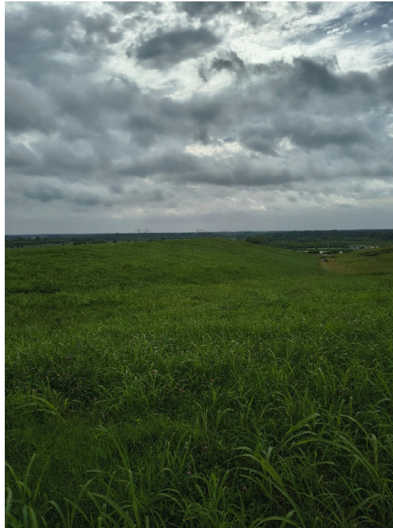
Looking east - south side of closed Landfill