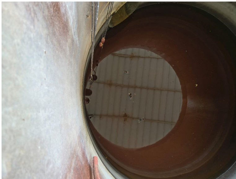
Verifying leachate levels in Division 1 pump station