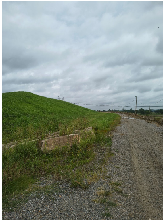
Looking north along east side of landfill